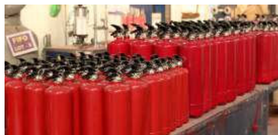
Assembly of FE's