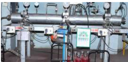
CO 2 Filling