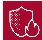
Resistance against fire