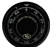
Mechanical combination lock